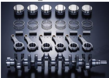
2JZ-GTE 3.4L KIT